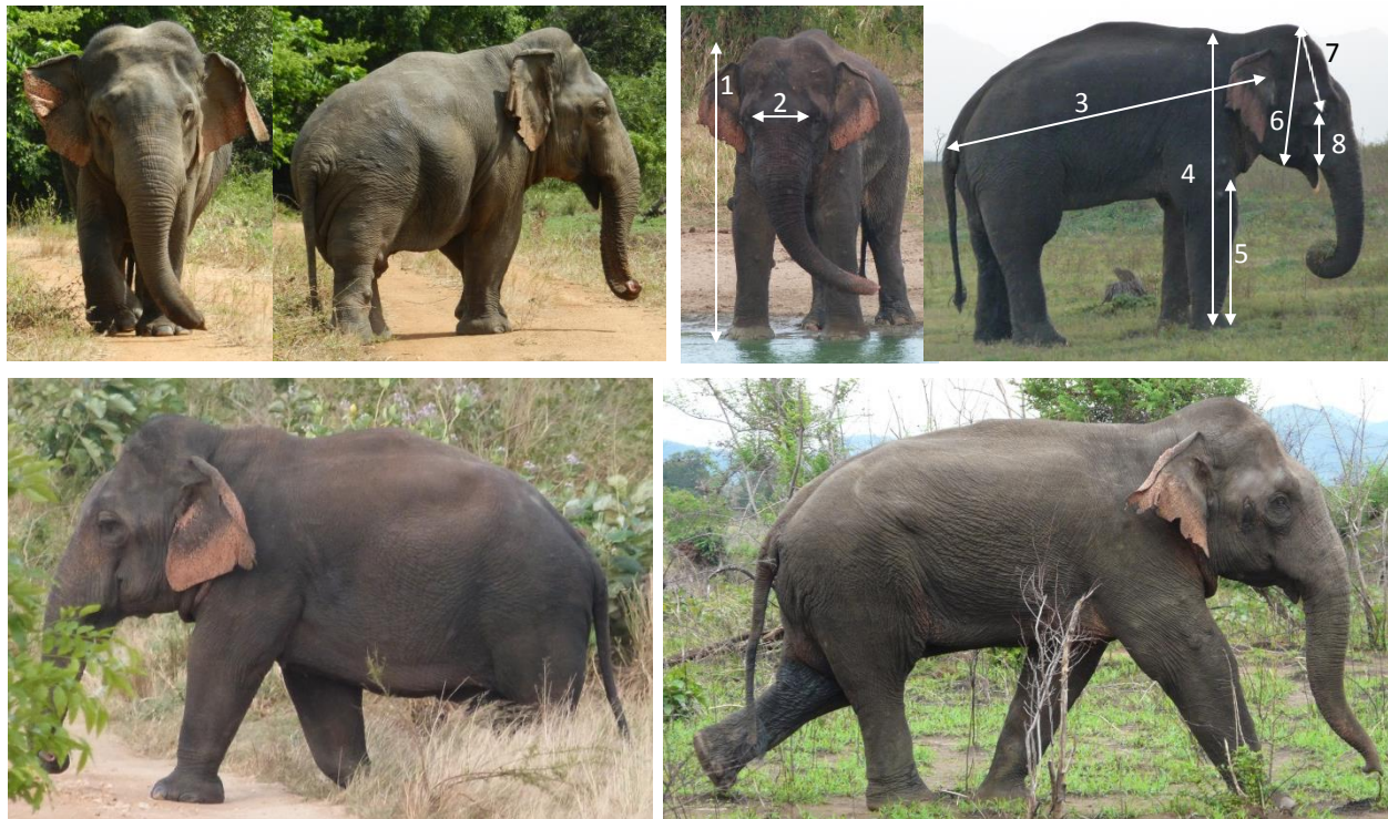
Fig. 2: Dwarf M429 and wild type adult male M054

M459 (left) proposed dwarf, compared to M054 (right) a typical mature adult male. Numbers indicate ratios given in Table 1 (see methods) as follows: 1) Head to foot; 2) Width between the eyes; 3) Body length from base of tale to ear canal; 4) Shoulder height; 5) Foreleg length; 6) Top of skull to chin; 7) Top of skull to eye; 8) Eye to tusk sheath